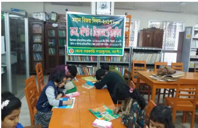
The photograph was received from Naogaon district public library