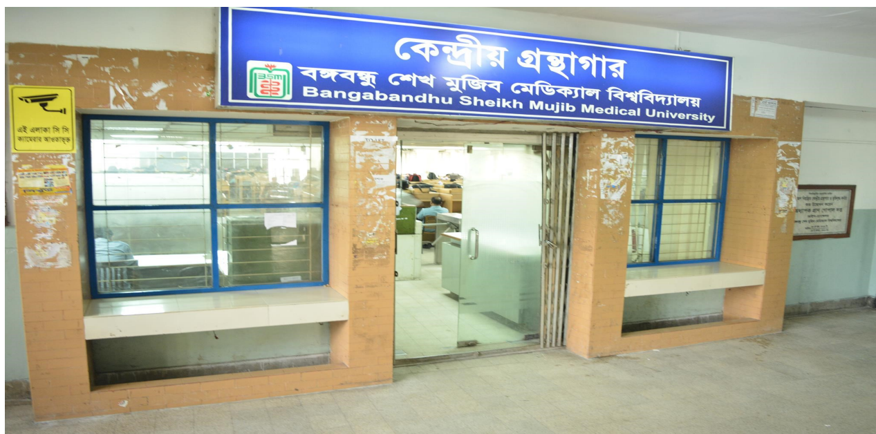
BSMMU Central Library

M edical library plays an important role in the promotion of healthy lifestyles. It is designed to assist physicians, teachers, researchers, students, patients as well as information specialists. The main task of this type of library is to provide information to improve, update and evaluate health care. They typically found in hospital, medical college and in the industry. Medical library is regarded as health library or hospital library.