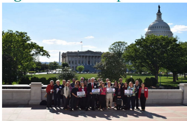
IFLA Global Vision regional workshop participants outside the Library of Congress in Washington D.C.

The first regional workshop of IFLA's inclusive and high-level Global Vision discussion started on 3 May 2017 at the iconic Library of Congress (LoC) in Washington D.C., United States.