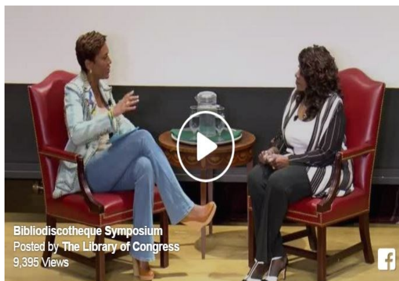
Bibliodiscotheque Symposium Posted by The Library of Congress 9,395 Views