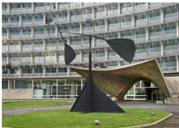
UNESCO HQ