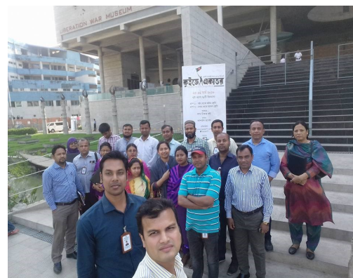
Participants were amazed to see the Museum.

Side Tour and Practical Session: Participants availed the opportunity to visit Mukti Joddho Museum, Agargoon.