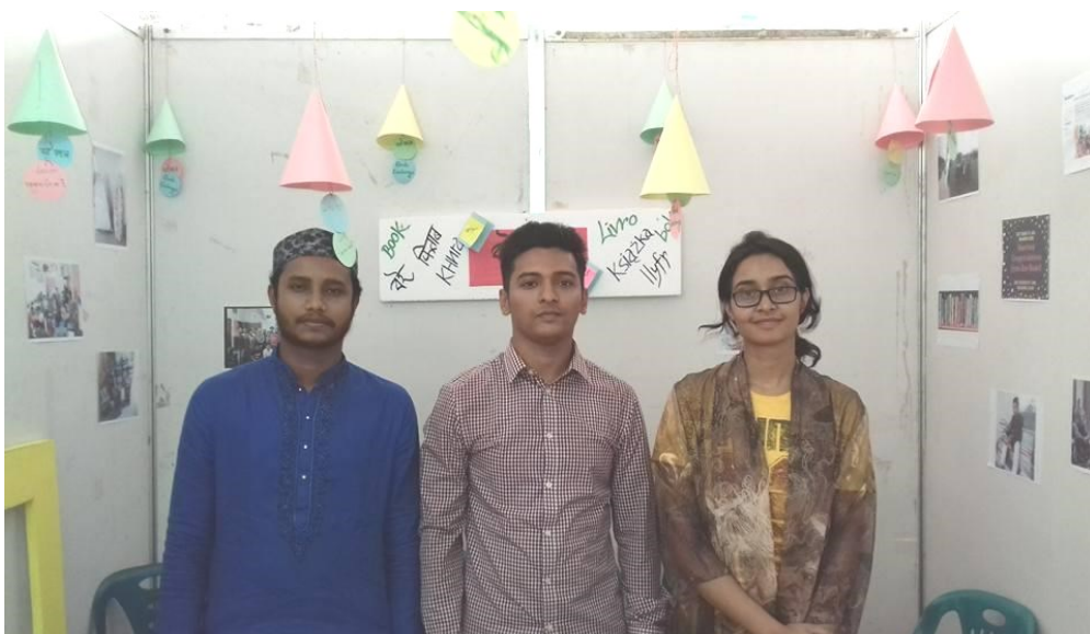
One of the Stalls(Boi Bodol) of Active Citizen Regional Achiever's Summit 2018, at Bangladesh National Library Premises, Agargoan, Dhaka, 10 March 2018. Few members are in the Stall.