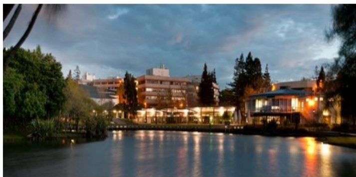
The University of Waikato Campus at dusk.

University of Waikato, Hamilton, New Zealand