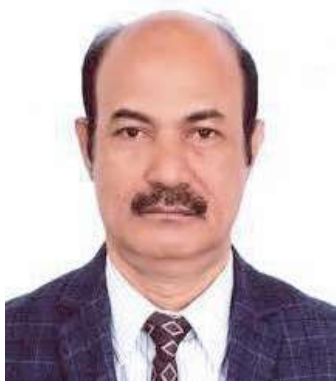
Executive Chairman Bangladesh Agricultural Research Council

We are thankful to TLT board for providing us with an opportunity to be the event partner and sponsor of TLT award and fun night 2019.