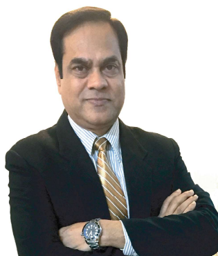
Senior Manager and Head icddr,b Library