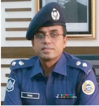
Deputy Police Commissioner (North) Chittagong Metropolitan Police

I feel very proud and honoured to be able to present at TLT Award Night 2019 as the special guest. It is excellent news for the library professional that they have got a platform where they can express themselves and got the appreciation of their hard work and contributions to the library field.