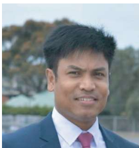
Editor in Chief TLT and Program Coordinator

It gives me great pleasure to welcome all the award winners and their families, all LIS professionals, academics, researches, students and guest's tonight's function which combines TLT's award night with a celebration of the 2nd anniversary of the founding of its journey in Bangladesh.