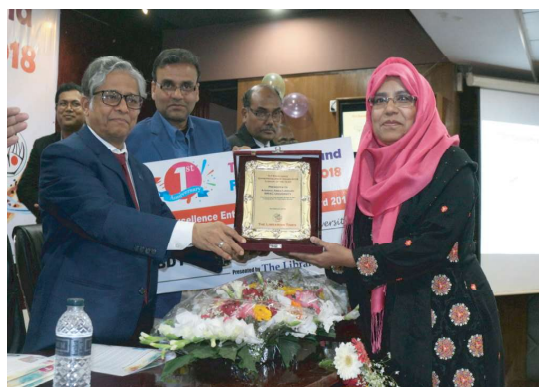
Ayesha Abed Library, BRAC University wins TLT Excellence Entrepreneurship Award 2018