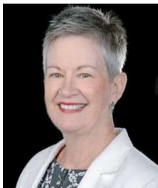
President-Elect IFLA ALIA Fellow