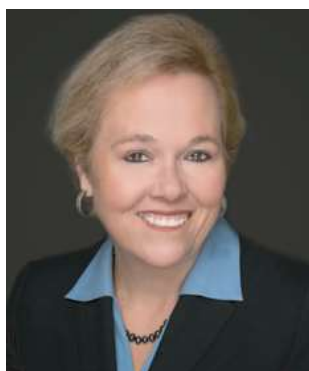
Executive Director Association for Information Science & Technology (ASIS&T)

On behalf of the Board of Directors and membership of the Association for Information Science and Technology (ASIS&T), we send our congratulations as you celebrate the 2nd year anniversary of TLT. We wish you every success at the TLT awards and fun night 2019. We are proud of your awards initiative and it deserves every recognition. ASIS&T is delighted to support the library and information professionals of Bangladesh and we wish to welcome you to our community.