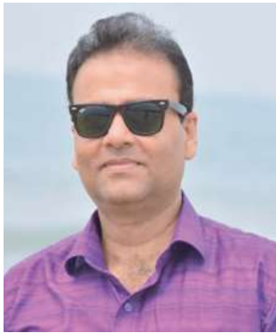
Dean School of Undergraduate Studies National University, Bangladesh

I am pleased to know that TLT is once again going to arrange Award Giving Event for the library professionals and students for their achievement and merit.