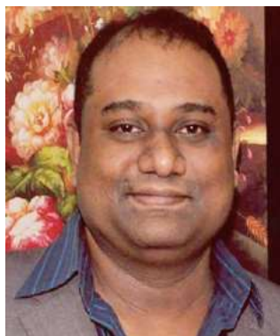
Chairman MH Group

It gives me great joy to be the part of TLT award and fun night 2019. I would like to offer a big congratulation to TLT editorial board for organising 'TLT Award Night 2019'. I believe in my heart that such kind of awards and professional recognition motivates professionals to perform their duties more efficiently.