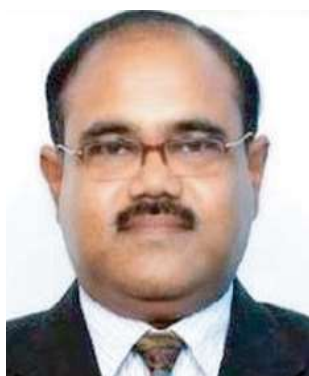
Secretary-General Library Association of Bangladesh (LAB)

It is great! The Librarian Times (TLT) is going to organise The Librarian Times (TLT) award and fun night 2019 on the eve of its 2nd anniversary.